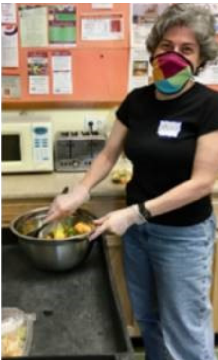
The Upper Valley Haven

Funded pavilion tent to enable outdoor food pantry services as needs increased.