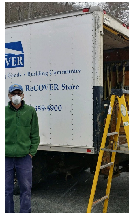
The Cover Store

Funding for additional staff and supplies to meet increased demand for repair for older adults